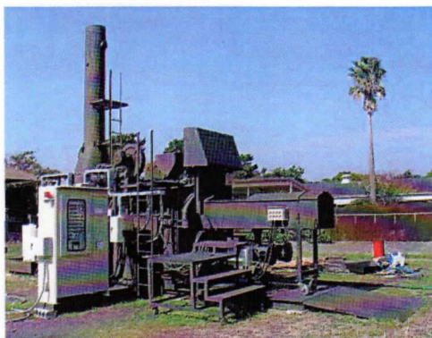
■ Scenery of prevention of epidemics maneuver

This is an incinerator of the decomposition, the migration and the local assembled type corresponding to the chicken influenza which is generating all over the world. Since infected chickens are not moved from the generated site, the virus dissemination can be prevented. By decomposing, weight can be dispersed and is able to move by two ten-ton tracks. Therefore it is possible to carry in narrow roads such as in mountain area and also into the poultry farm that has the weight limits bridge. By high-efficiency combustion of reverse combustion, afterburning and high combustion system, which is proven measure by BSE incinerator, it requires much less fuel consumption.